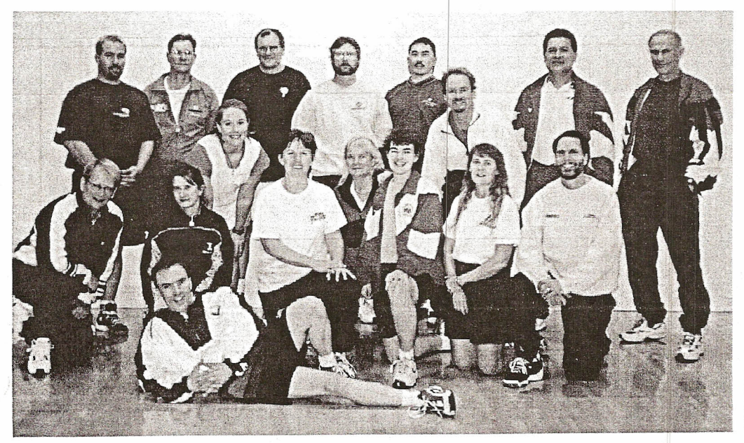
Attendees of the recent AmPro certification seminar, held at the Sports Mall, learned a great deal about effective racquetball teaching methods.